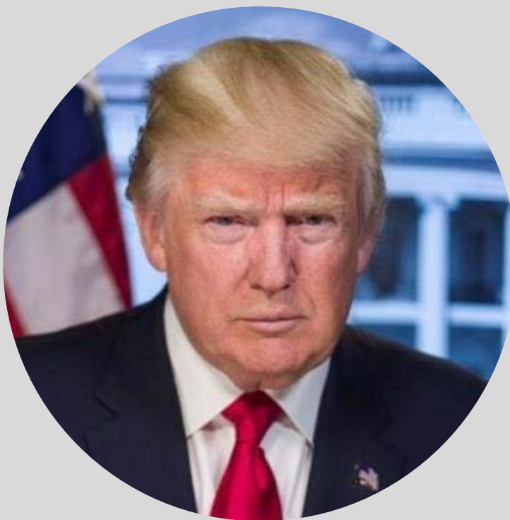
DONALD J TRUMP PRESIDENT OF THE UNITED STATES OF AMERICA